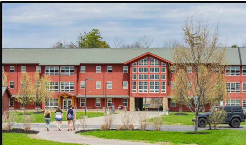
The Suites at Laker Landing

Come join our professional and friendly team